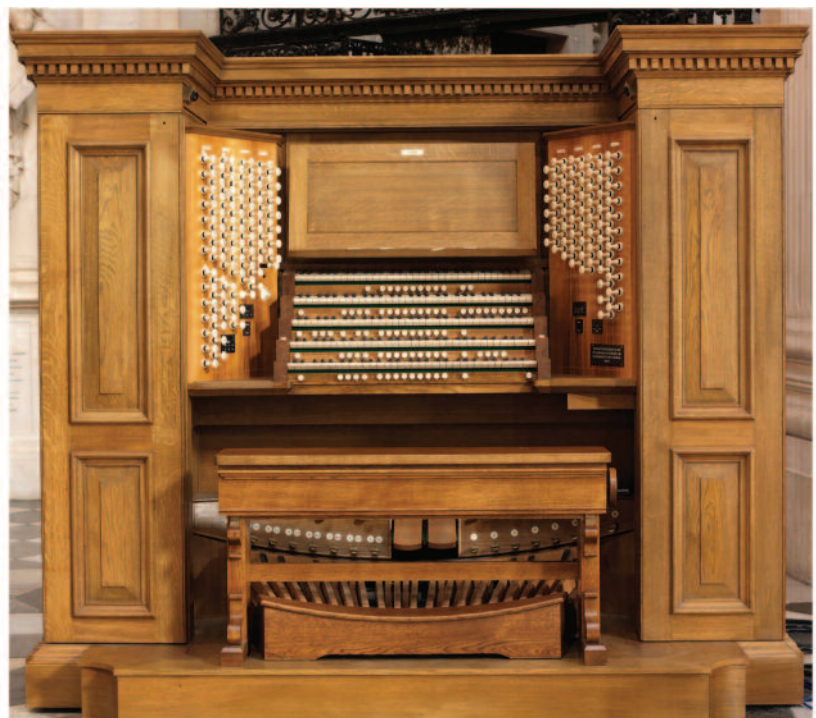
St Paul's new Nave console

The two lesser stops – the Contra Posaune and Trumpet – have been voiced on a lower wind-pressure