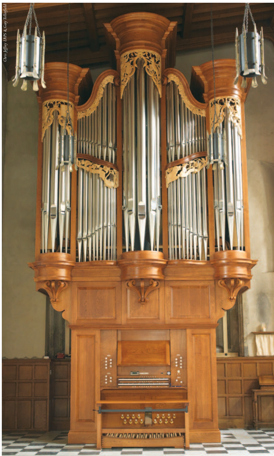
St Giles', Cripplegate

with pencil and paper, even the lines you draw will have a thickness which makes precision very difficult. With CAD, items are the size they are meant to be. It is now possible to tell someone precisely how to make a component for the organ and be sure it fits, even when the organ is yet to be built. Modifying drawings is also much easier. Rollerboards,