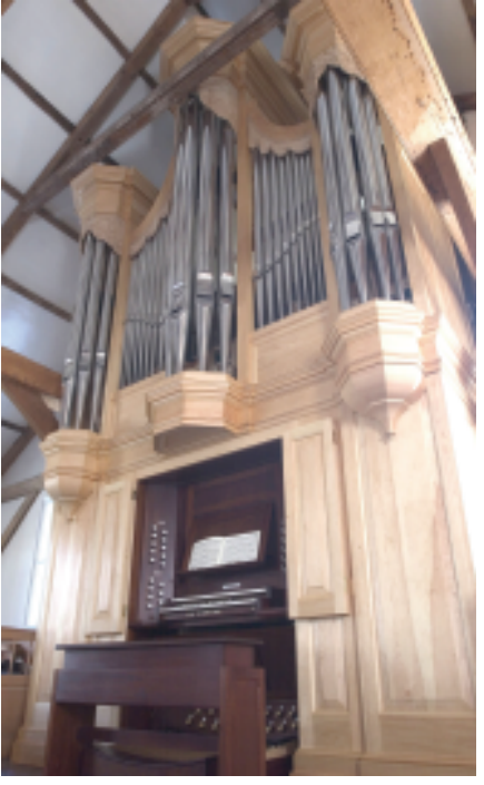
Elegant Mander at Cape Cod

Next time I hope to look at some slightly larger instruments, and warmly encourage organ builders to keep me informed by e-mail (PaulHale@diaphone.clara.net).