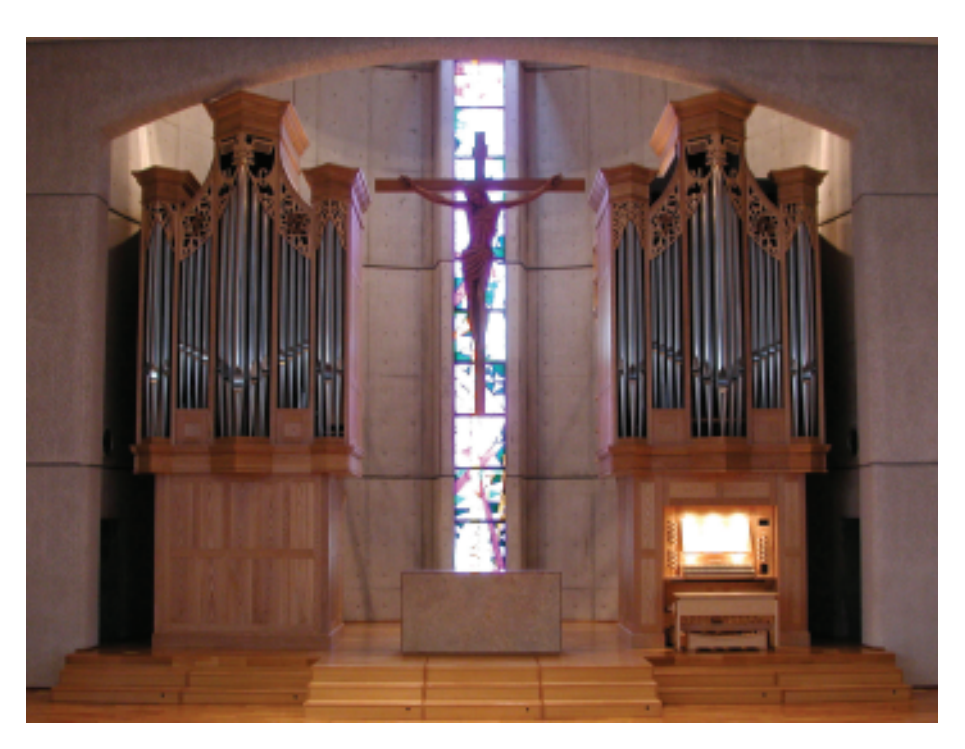
Mander organ at Nigawa Gakuin School, Japan